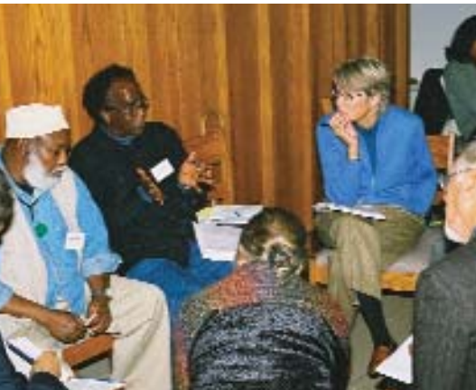
Consultation participants break into small groups to process and form response statements to the massive input presented by numerous speakers.

The original plan was to hold a small meeting of people who live and work among Muslims to talk about trust-building relationships and what constitutes an appropriate witness to them. But as word spread about plans to hold such a forum, more groups and organizations who have been engaged within Muslim communities over the years asked to come and to be involved in whatever would be presented.