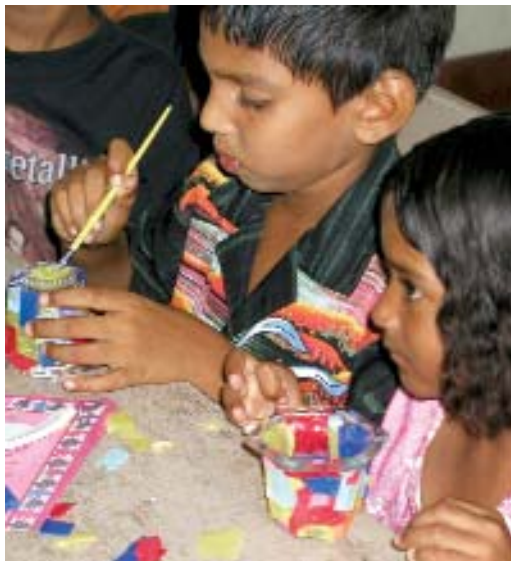
Trinidadian children concentrate on a craft project during Vacation Bible School in Summer 2003.