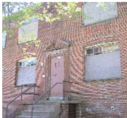
An identical neighboring building that shows the condition of Conquest House when it was first purchased.