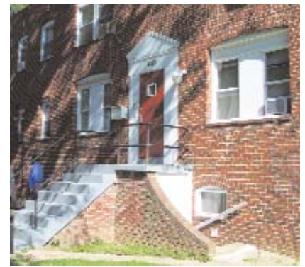
The renovated Conquest House at the time of dedication.