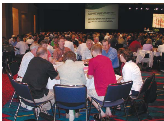
Delegates seated at round tables during an MC USA session on Friday.

Charlotte was an exciting, inspiring time for those who had the opportunity to gather with members of Mennonite Church Canada and Mennonite Church USA. Each day, 747 persons from Virginia Conference gathered with thousands for worship services on the theme "Can't Keep Quiet," based on Acts 4:20, "We cannot stop telling about the wonderful things we have seen and heard." This theme challenges the Mennonite Church to speak the good news, to pray for boldness and believe that God will act through us.