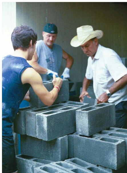
PIM team members playing jump rope with children (above) and moving concrete blocks (below).