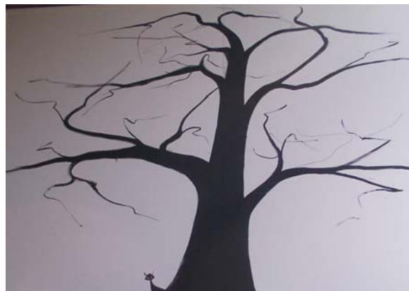
The Tree of Memories