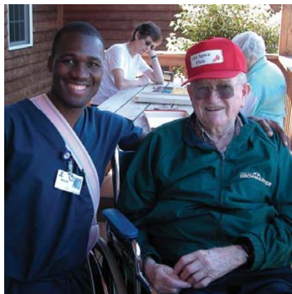
A caretaker and resident at Virginia Mennonite Retirement Community, Harrisonburg.

Aging with quality is a multifaceted endeavor. It is comprised of both physical and spiritual dimensions and is concerned with the individual as well as the community within which individuals live. It is not inevitable that health will decline as we get older. People of any age can improve their health by adopting healthy behaviors. The Centers for Disease Control (CDC) suggest six strategies that contribute to “aging with quality.”