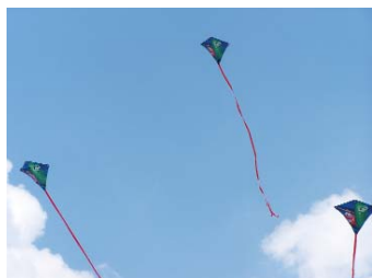
Kites that students at Maranatha School for the Deaf flew one breezy afternoon. Some students experienced it for the very first time.