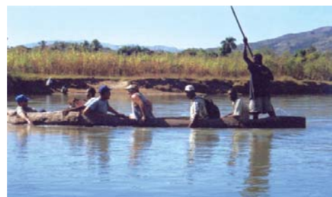
The Haiti work team travels to their work site in dugout canoes.