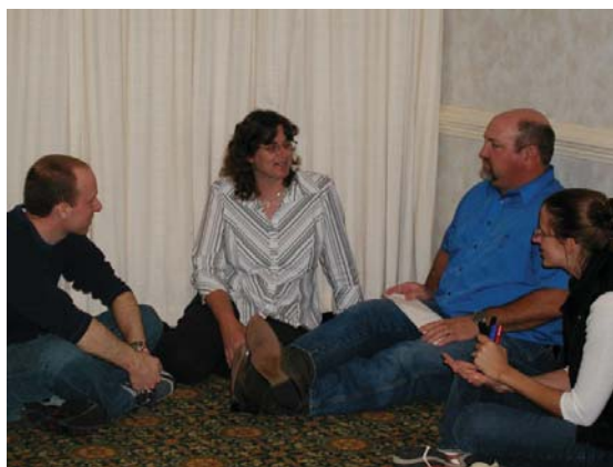
Youthworkers share among themselves at the Youthworkers Retreat in Williamsburg, Va.