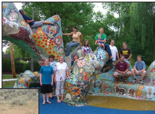
(above) Members of the team from Trissels Mennonite Church that served in Nashville, Tenn.

It turns out this was a great experience for our family. We spent eight days in New Mexico. We had the privilege of living among the Navajo people and working with them. The girls were part of the VBS and assisted in teaching crafts and games. The greatest joys for our family were the ability to be immersed in a different culture, have the girls be actively involved, and work alongside the Navajo people in sharing the gospel of Jesus. The experiences we had have affected us all in different ways and some that I’m sure we have yet to see.