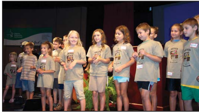
Children recite Bible verses during the Friday evening worship service at Assembly.

It was a weekend packed with precious gems - creative activities, lively children, friendship, and learning! An experience to treasure!