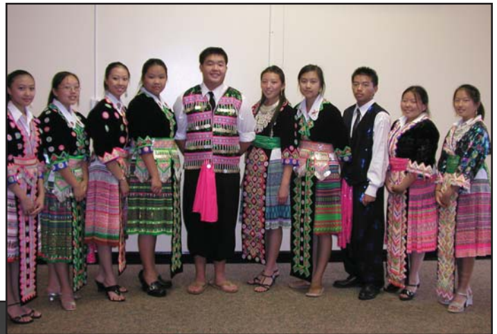
(right) The Hmong dancers and singers who entertained during the World Neighbors Mission Festival.

from the delegates will be used to further refine this new structure.