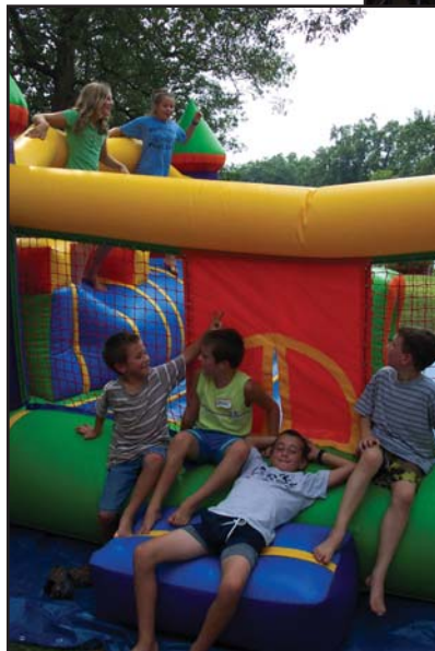
(below) Children enjoy an inflatable castle, a fun aspect of their program, "Jesus, my heart's treasure."