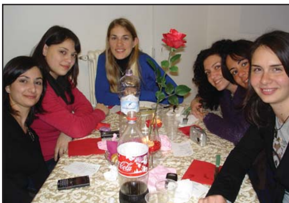
Some of the women who gathered at Centro Koinonia on Woman's Day and enjoyed a delicious meal and a time of fellowship.