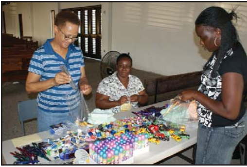
At the Good Tidings Mennonite Church, Kingston, church members prepare the gifts for the children who attend the Christmas Children's Treat.