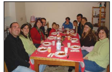
The Mediterranean region "missionary family" anticipates a delicious lasagna meal together during the holiday season.