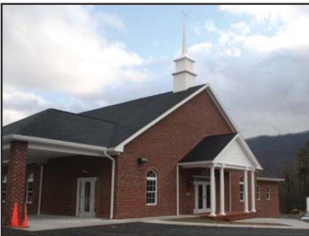
Hebron Mennonite Church

And, to have it done for the Christmas program on the Saturday night before with the first Sunday worship service the Sunday before Christmas! It