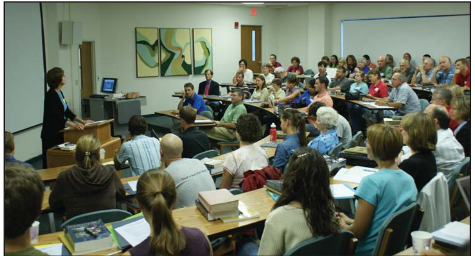
The Perspectives class filled the largest classroom at Eastern Mennonite Seminary to capacity. Participants gathered each Tuesday evening for 15 weeks, for lessons taught by 15 different instructors.

The excitement culminated in 68 more people completing the program: 7 received graduate credit through Eastern Mennonite Seminary; 1 each received undergraduate credit through Eastern Mennonite University and Trinity Evangelical Divinity School; 14 earned certificates; and 45 audited. In 15 lessons taught by 15 different instructors, the course took these students through four missions studies: biblical, historical, cultural and strategic.