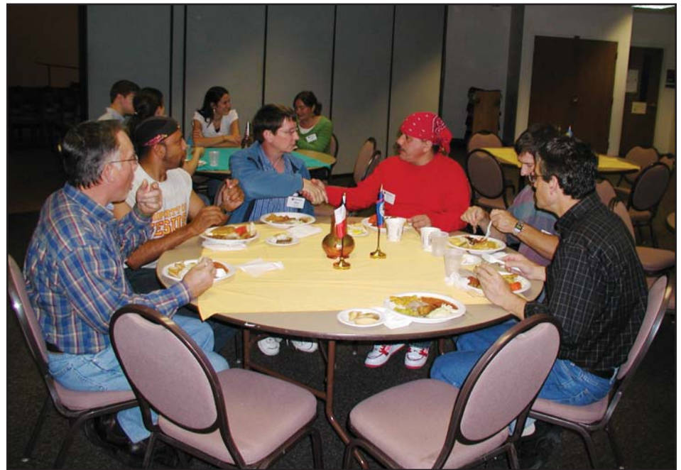
Perspectives participants enjoyed an international meal and presentations halfway through the semester.

Although I took Perspectives for credit as a seminary elective, it would be more accurate to call it, not a class but a movement seeking to call Christians to join in God's purposes by spreading the good news of salvation in Jesus Christ to every corner of the globe. Virginia Mennonite Missions (VMM) sponsored the course I attended on the campus of Eastern Mennonite Seminary in Harrisonburg, Va. The interest in, and buzz about