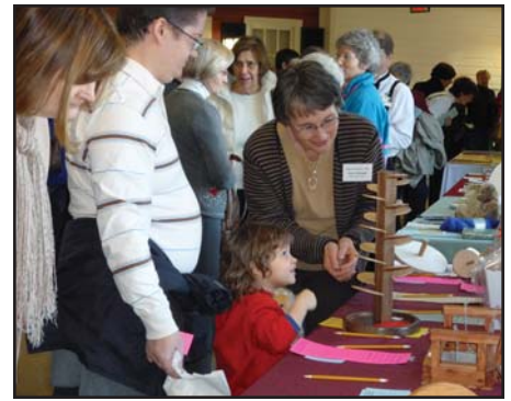
VMRC's Winterfest in January 2009.

Our response begins with worship, praise and thanksgiving. It then includes lament and intercession. That's how we get through winter.