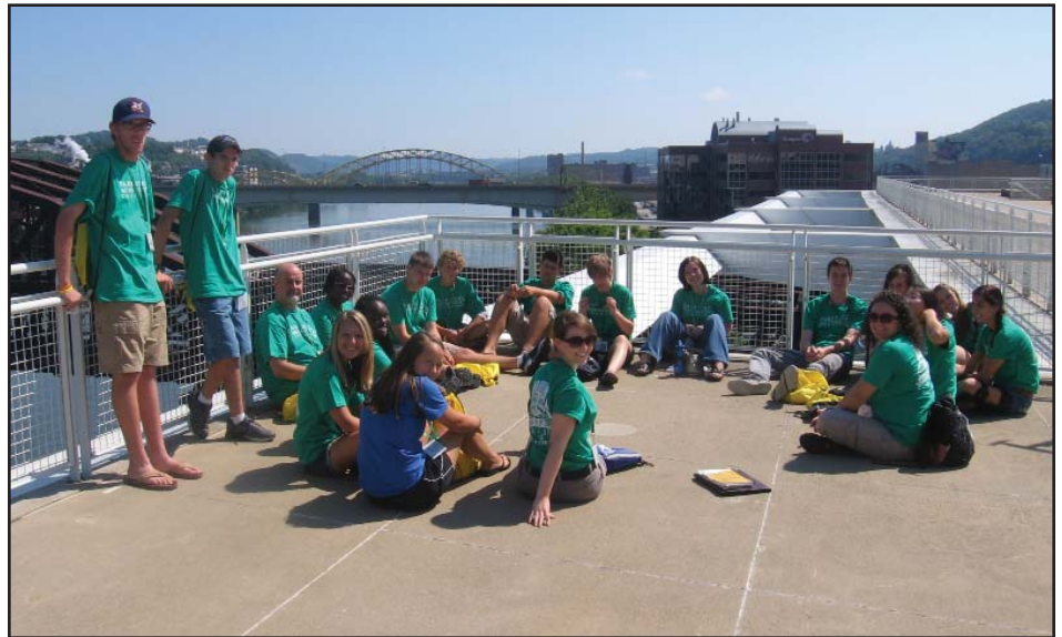
Park View Mennonite youth group meet on top of the Convention Center in Pittsburgh to process how MC USA Convention experiences are impacting their lives.