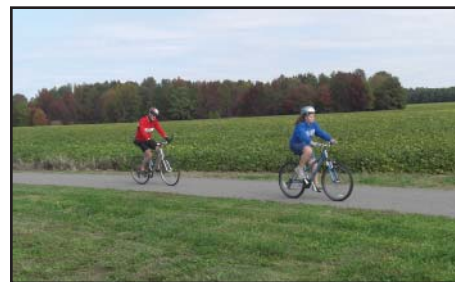
Cyclists enjoy biking the Virginia Capital Trail during WCRC's Bike-n-Walk on October 22.

with adult groups as well. The flexibility of the central Commons building allows groups of up to 60 people to have both meeting and dining space in the same building.