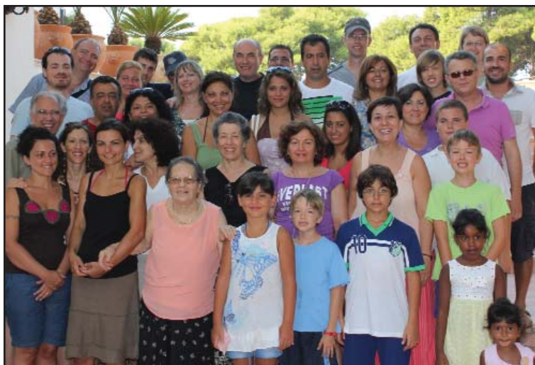
Smiling faces mirror the joy of retreat.