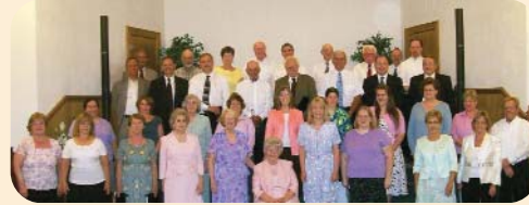
"Mennonites" choir at Mt. Pleasant

Friday, July 27 9:00 p.m. at Mt. Pleasant Mennonite Church "Mennonites" choir performance