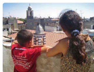
Middle East crisis relief Syria & Lebanon