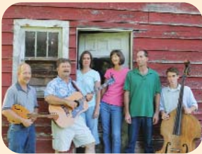
Lucas Creek Band

Local homemade ice cream available for purchase