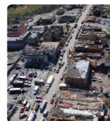
Tornado destruction relief West Liberty, Kentucky

a project of Mennonite Central Committee