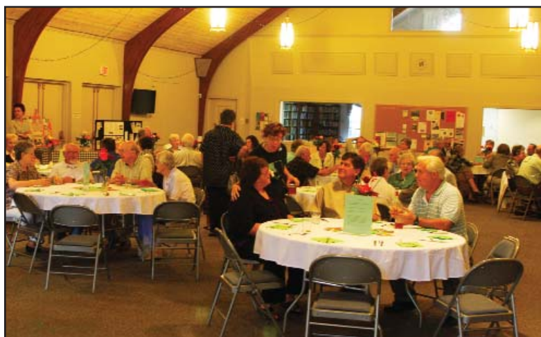
Pantry supporters celebrated the 20-year milestone with a dinner on May 17.

Client comments such as “You make me feel like a person and not a bum who has to ask or beg for food for my family” and “If it was not for this pantry, then we would not make it through the month” are what have kept me working at the pantry all these years.