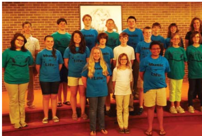
The WRCS middle school chorus that toured around Virginia including stops in the Waynesboro and Harrisonburg areas.

Living on the peninsula, the ship building industry is major. This year a group of 11 middle school students, sponsored by two parents, participated in the VA Regional Ship Repair LEGO competition. This competition builds on team work, presen-