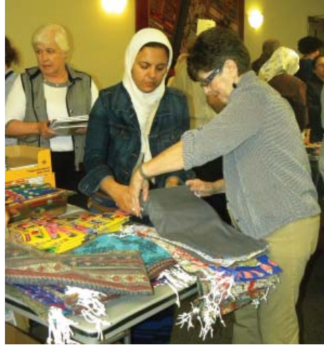
The blitz was a time of fellowship between Park View Mennonites and members of the Islamic Center of Shenandoah Valley.

The church foyer was transformed into a production room for adults and the library for children. The shared task was filling col-