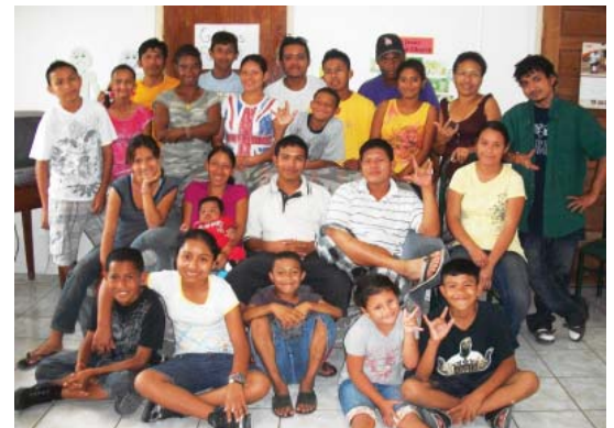
The Jesus’ Deaf Church members, after Sunday worship service.