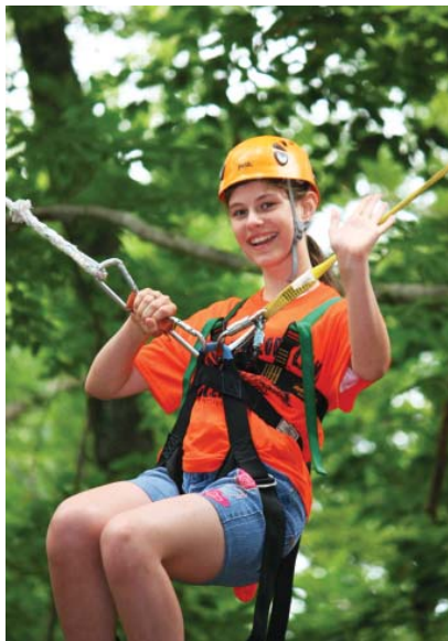
A camper at Williamsburg Christian Retreat Center enjoys the zip line.