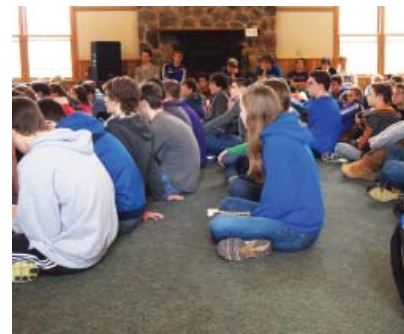
Youth listen and engage in a main session.