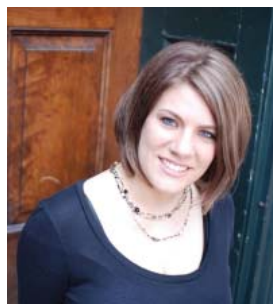
Rachel Held Evans

Reprising themes she explores in her books, Evolving in Monkeytown (Zondervan, 2010) and The Year of Biblical Womanhood (Thomas Nelson, 2012), and on