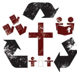
(left) Eastside's vision, represented visually.