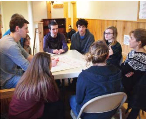
Youth and sponsors from Lindale Mennonite Church discuss content from the sessions and address questions.