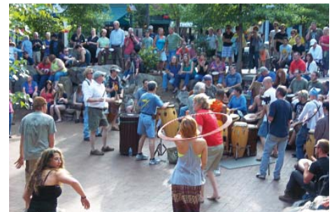
Weekly Friday night drum circle is a great space for connecting and conversation.